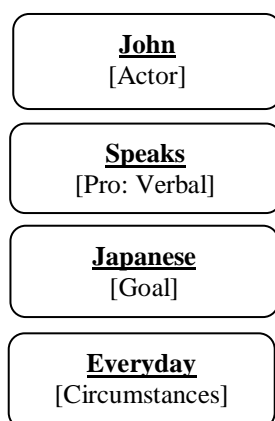
Figure 2 Sample of Data Coding

textual data presented on the exercises. The researcher focused on analyzing the actors, processes, and circumstances in each sentences or phrases of the English grammar exercises. For example, John speaks Japanese everyday.