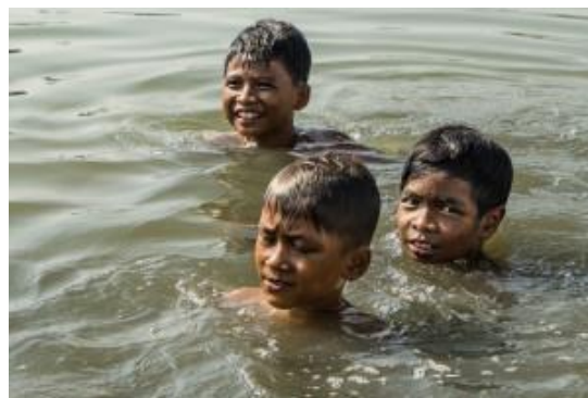
Figure 7.

"Every weekend, Arif ... (go/goes/went/gone) swimming in the Ciliwung river."