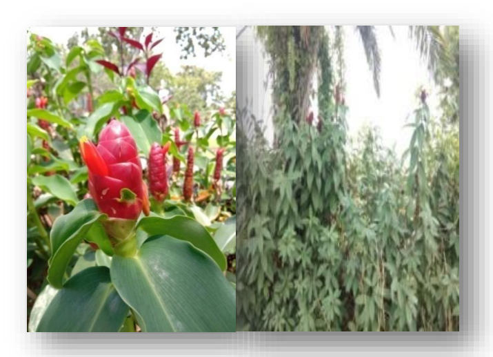
Figure 1 . Costus speciosus

This research was conducted in September 2020. The pacing plant used in the study was sourced from Buring Kencana Village, Blambangan Pagar North District, Lampung Regency (Figure 1). The study took place at the Integrated Laboratory and Technology Innovation Center of Lampung University. The pacing plants used were approximately 100 days old and collected systematically. The were involved several research steps, including sample preparation and simplification, extraction, and identification of compound groups in using thin-laver the samples chromatography (TLC).