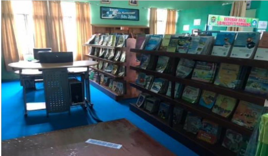
Image 1. Photo of bookshelf and the state of the school library