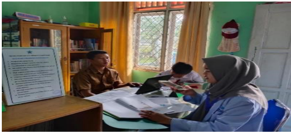
image 3. Photo with school library management